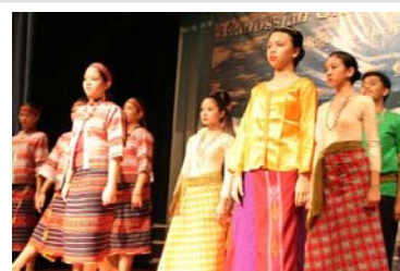
The Cultural Night performance in national costumes