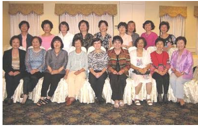
Class of 1961 reunion in Toronto