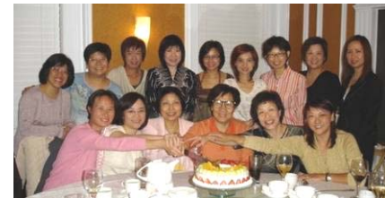
...and also in Toronto!