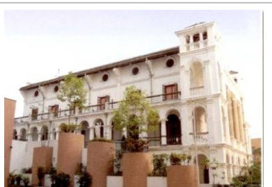
The Sacred Heart Chapel

Thanks for your generous donations - the Sacred Heart Chapel, which is located at the Canossian Headquarters on Caine Road, has been successfully renovated to restore its beauty as a Grade II historic building!