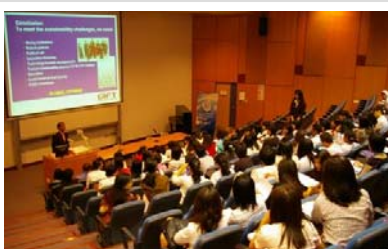
Attending the conference