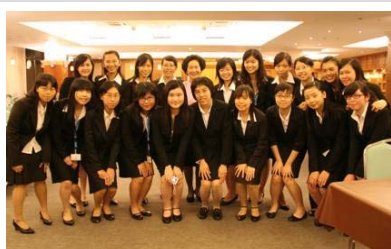
Delegates from Hong Kong after the Opening Ceremony

In the afterthought written by the organising committee, these humble committee members have attributed much of the event's success to their schools and teachers for their unfailing support all the way through, and to the sponsorship and advice from their sponsors and past students. What a joy to see that we have such lovely, good-natured and capable younger sisters in our mother school! For more information of the Conference, please visit www.smcc-canossian.org/cgyc .